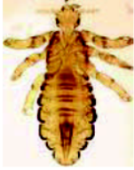
Figure 1: Head Louse Pediculus capitis

Head lice are small, wingless parasitic insects. They are typically 1/6 -1/8 inches long, brownish in color with darker margins. The claws on the end of each of their legs are well adapted to grasping a hair strand.